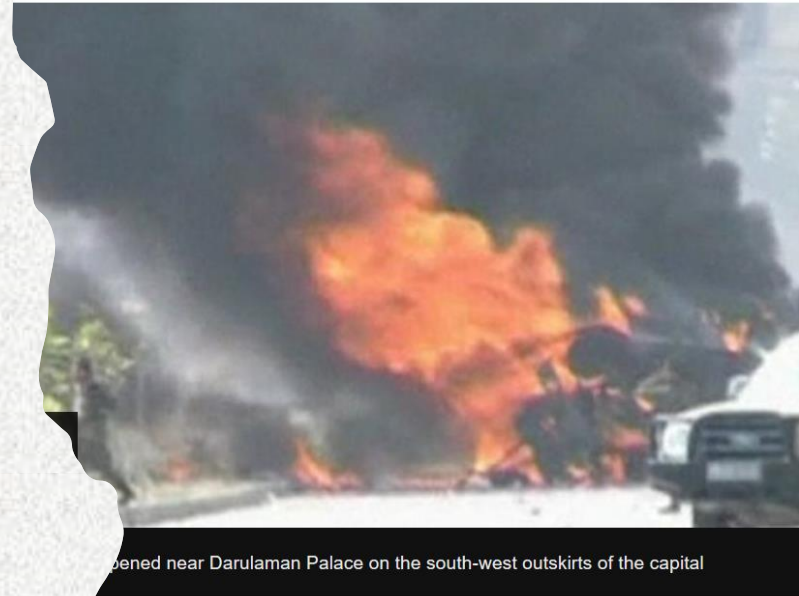
...ened near Darulaman Palace on the south-west outskirts of the capital

...icide bomber has rammed an ...den car into a bus carrying ...f the International Security Assistance ...e Afghan capital, Kabul, killing 17